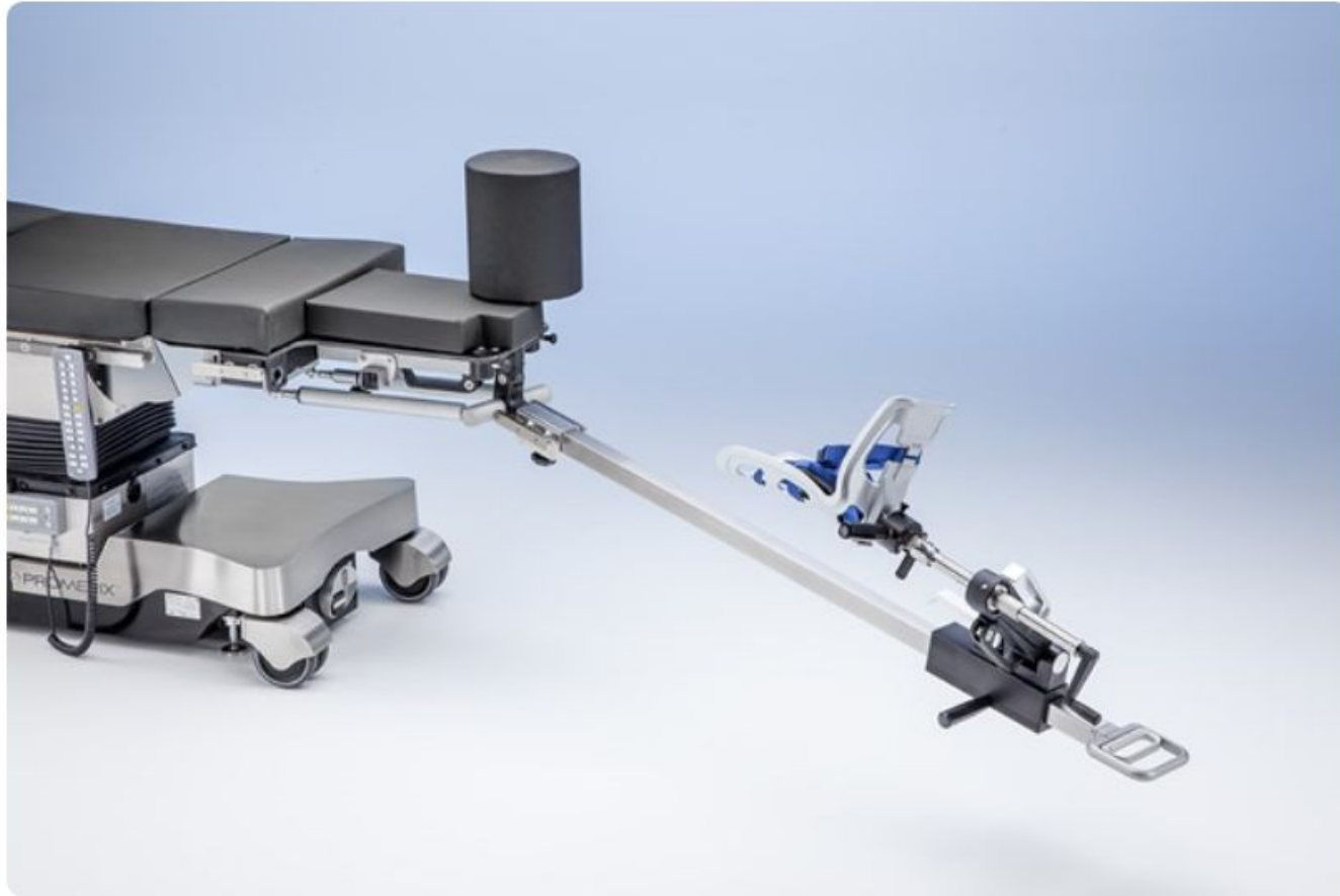
Basic trauma system